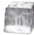
Full Cube 1 1/4" x 1 1/4" x 1 1/4"