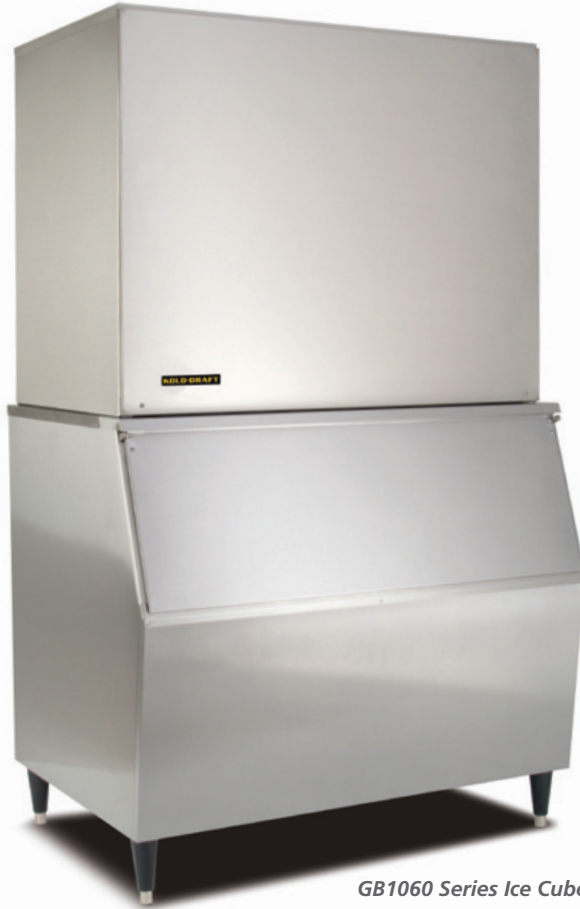
GB1060 Series Ice Cuber on a B950 Bin

The KOLD-DRAFT B950 bin holds 950 lbs. of ice. The B950 has a polyethylene liner and stainless steel exterior front, sides and top. It is insulated with non-CFC foam for exceptional rigidity and optimum insulation. The B950 comes with an insulated stainless steel lift up door.