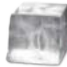
Full Cube 1 1/4" x 1 1/4" x 1 1/4"

The KOLD-DRAFT B950 Bin holds 950 lbs. of ice. The B950 has a polyethylene liner and stainless steel exterior front, sides and top. It is insulated with non-CFC foam for exceptional rigidity and optimum insulation. The B950 comes with an insulated stainless steel lift up door.