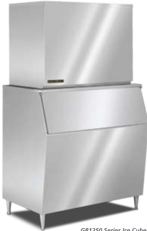
GB1250 Series Ice Cuber on a B950 Bin