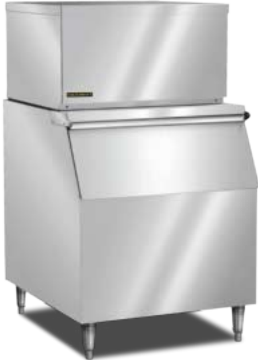
GT350 Series Ice Cuber on a B400 Bin