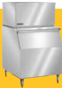
GT350 | B400

Please observe minimum circuit ampacity and maximum fuse size listed above. Fuse or HACR-type circuit breaker branch circuit protection within the range of minimum ampacity and maximum fuse size shall be provided or warranty may be voided. We reserve the right to make product improvements at any time. Specifications and design are subject to change without notice.